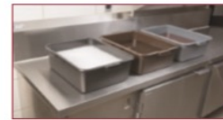
Use Bus Boxes to create a Wash-Floor Condition station