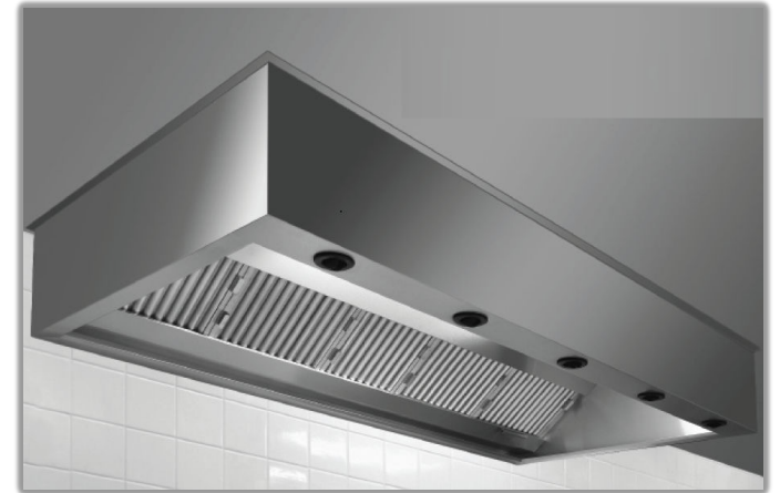
Splenor SPL-Prima Plus.